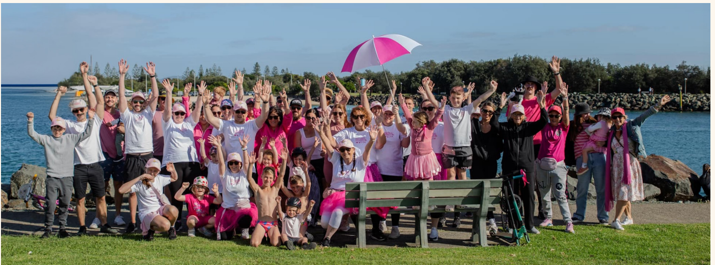
Pink Up Foster-Tuncurry

Ask local businesses to donate prizes to raffle and auction off at your events.