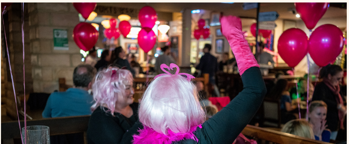
Pink Up Mudgee Trivia