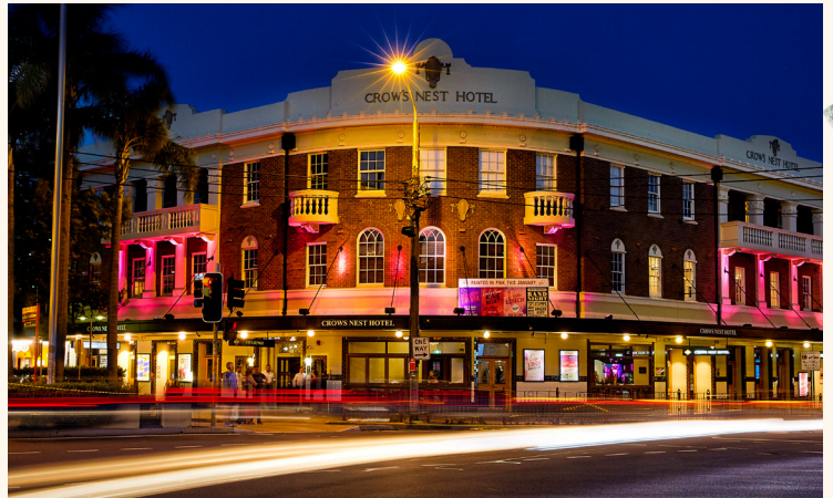
Pink Up Crow's Nest

We're talking high teas, garden parties, masquerade balls, trivia, bingo and more.